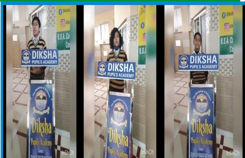
Speech Competition : "Importance of agriculture education in our Country"